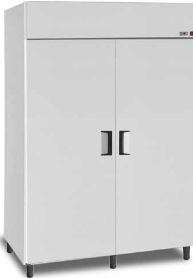
I-Ola P AG GASTRO*